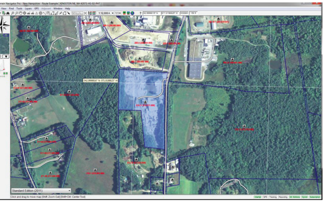
Premium parcel data on the TNP Desktop